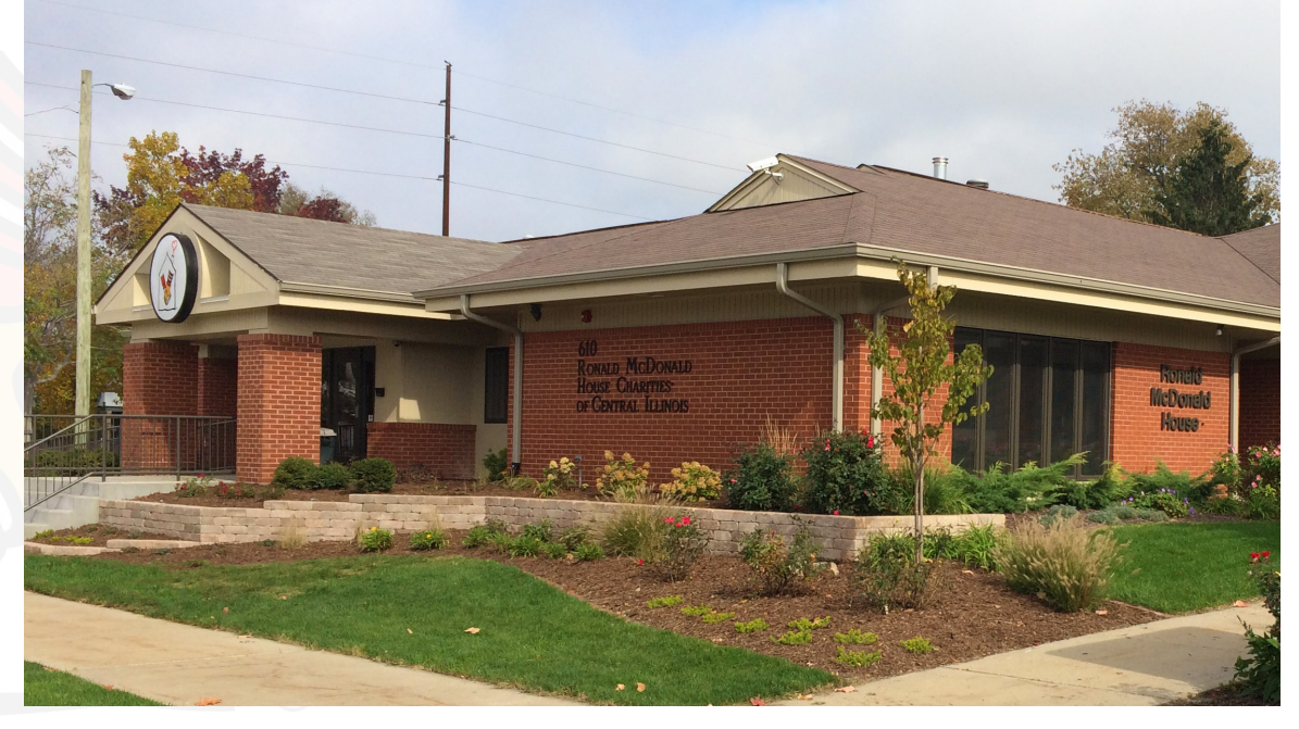
2014 Annual Report